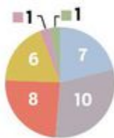
Ages 20 to 24

■ Disease/sickness ■ Accidents ■ Suicide ■ Overdose/toxic drug mix** ■ Service related ■ Homicide