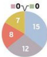
Ages 30 to 34